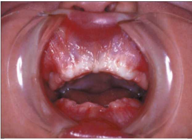
Figure 1. Newborn with irregular inferior alveolar ridge and underdeveloped multiple labial frenula.