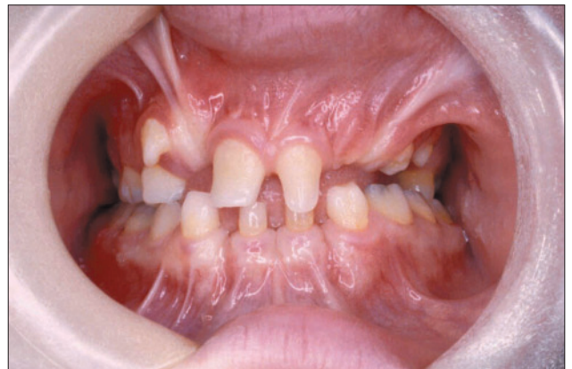
Figure 10. Multiple upper and lower labial frenula, congenitally missing lateral incisors, abnormally shaped upper incisors, and microdontic lower incisors.

should be taken. 5,16 Carious teeth can be restored with glass ionomer, amalgam, or composites, 5,8,16 always taking into account the possible presence of enlarged pulp chambers (taurodontism). 8 To modify abnormally shaped teeth, crown or composite build-ups may be necessary, 8 particularly microdents. Due to congenitally missing teeth, esthetic and