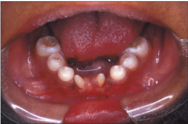
Figure 7. Occlusal lower view showing conical and microdontic incisors and congenitally missing lateral incisors. Atypical primary molars.