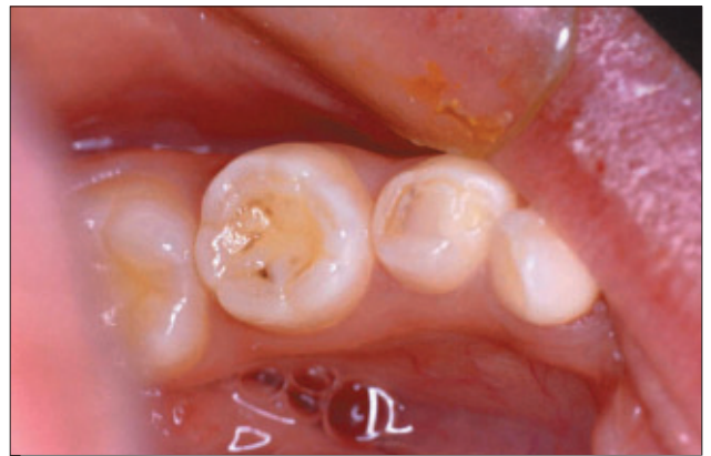
Figure 8. Detail of lower left second primary molar: wide central groove. The primary canine exhibits a talon cusp.