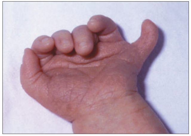
Figure 2. Detail of hand: polydactyly on the ulnar side and dystrophic nails.