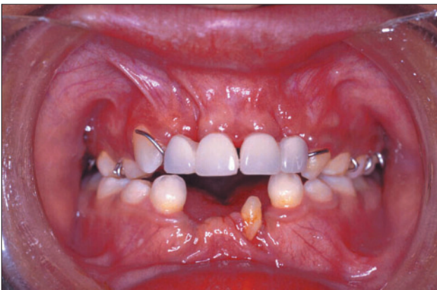
Figure 9. Upper anterior acrylic partial denture to maintain space and improve mastication, esthetics, and speech.