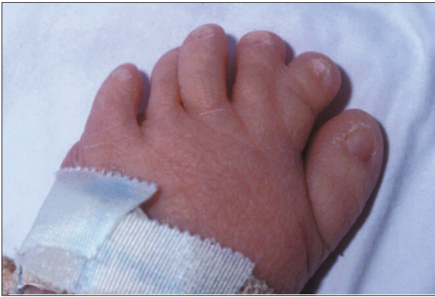
Figure 3. Detail of foot: syndactyly between the second and third toes and dystrophic nails.