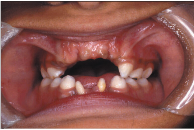
Figure 5. Front view showing multiple congenitally missing anterior teeth and small conical shaped lower incisors. Serration of the alveolar ridge in the anterior portion.